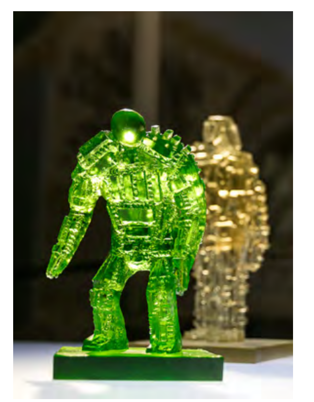
Monster Collection / Outer Space Monster by Campana Brothers